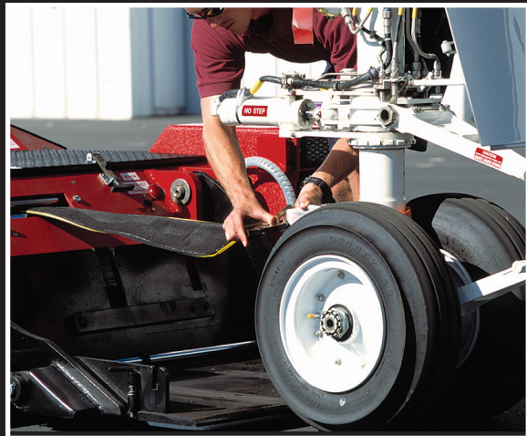
1. Attach strap/pawl adapter